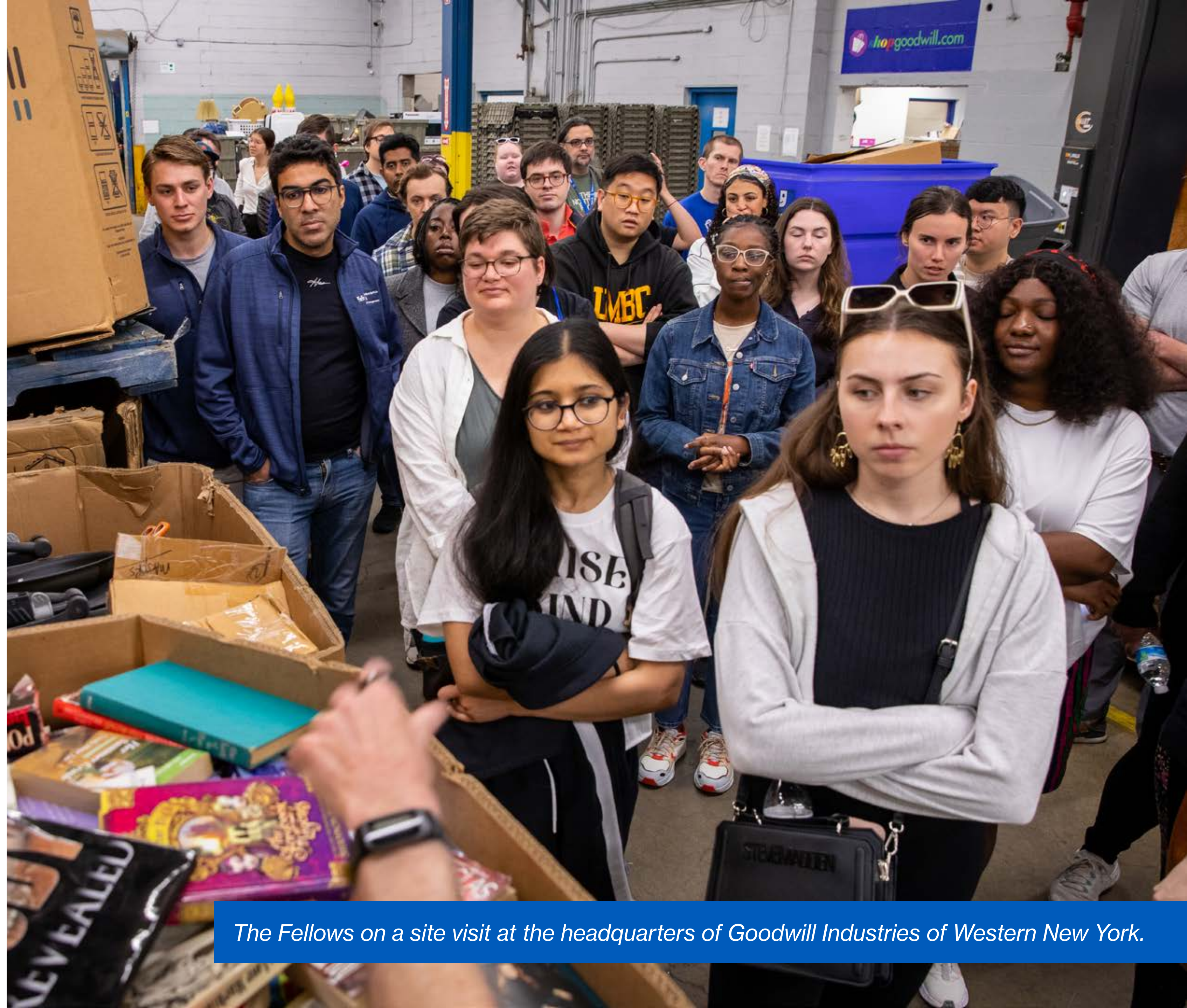
The Fellows on a site visit at the headquarters of Goodwill Industries of Western New York.

We want to give you whatever information you need in order to identify and encourage graduate students to apply for this program.