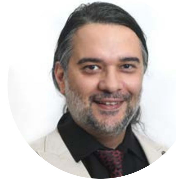
Botan Dolun PHILOSOPHY